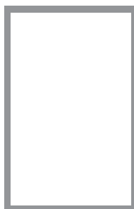
FULL PAGE* NON-BLEED 4.75" X 7.75" BLEED 5.625" X 8.625"