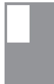
QUARTER PAGE VERTICAL 2.25" X 3.75"

* PUBLICATION TRIM SIZE IS 5.375" X 8.375" SAFETY MARGIN IS .25" ON ALL SIDES BLEED SIZE INCLUDES A .125" BLEED ON ALL FOUR SIDES