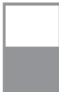
HALF PAGE 4.75" X 3.75"