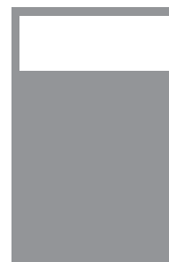
QUARTER PAGE HORIZONTAL 4.75" X 1.75"